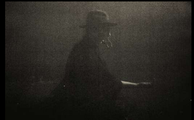
Tableau vivant by Claudia Castellucci